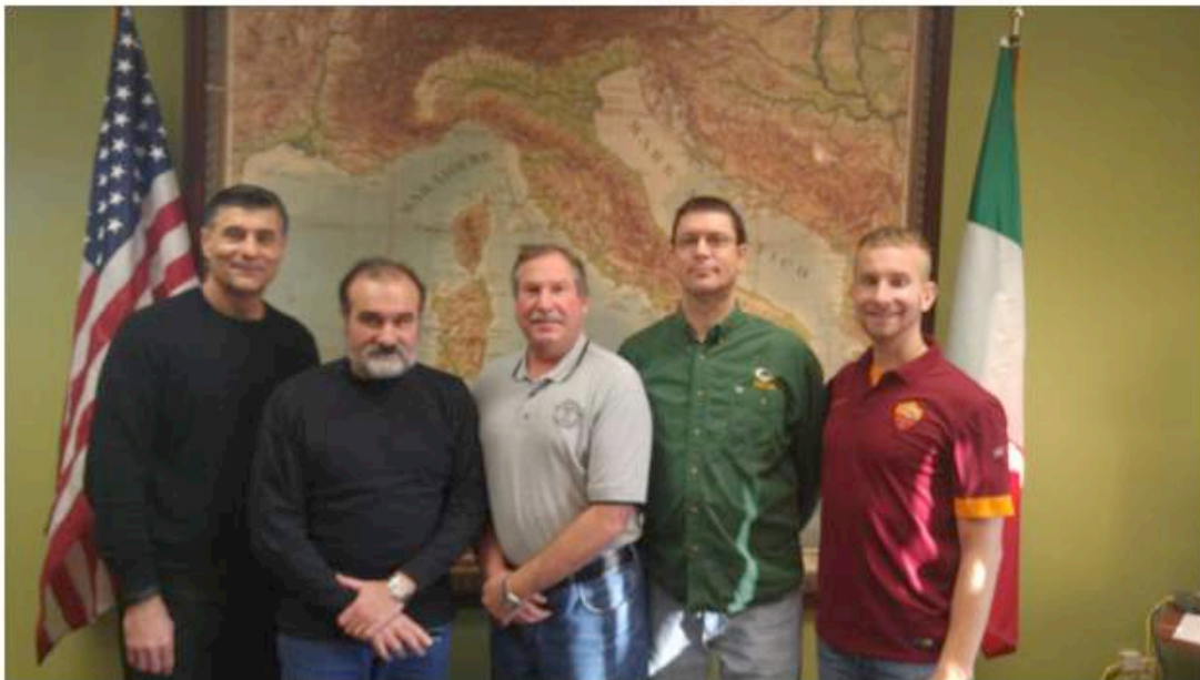
Pictured left to right:

The Bocce Committee appreciated that our brothers from the Italian Workmen's Club in Madison made the trip to participate in the tournament.