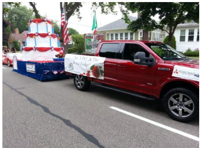
Veteran Float Driver Art Rozzoni guides us safely on Main St.