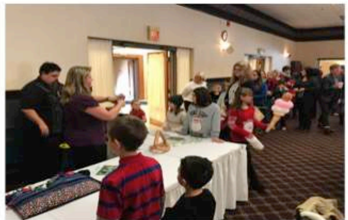
Choose a festive balloon animal!