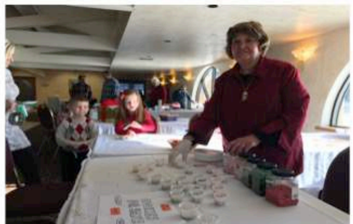
Decorate a cookie for Santa!