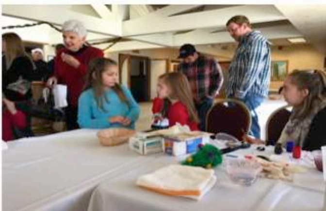
Tattoo and Face Painting fun!