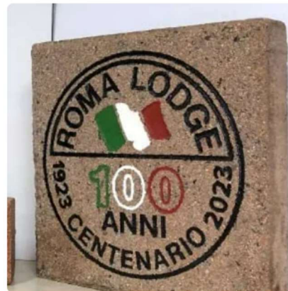
12" x 12" Brick $200.00