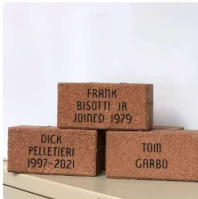
4" x 8" Brick $75.00

Orders taken will be completed and installed as time and conditions permit.