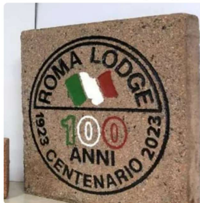
12" x 12" Brick $200.00