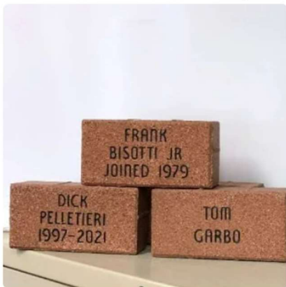
4" x 8" Brick $75.00

Orders taken will be completed and installed in the spring of 2025.