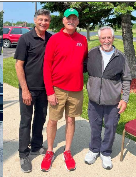
Current Roma Lodge president and past presidents were on hand.