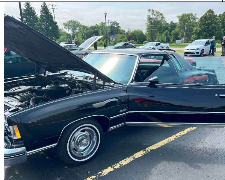
Rick Bonanno's newest classic - Chevrolet Monte Carlo