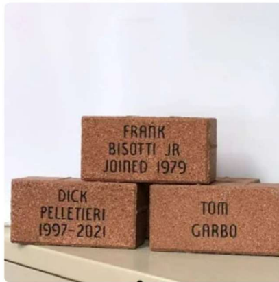
4" x 8" Brick $75.00

Orders taken will be completed and installed as time and conditions permit.