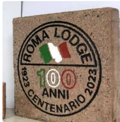
12" x 12" Brick $200.00