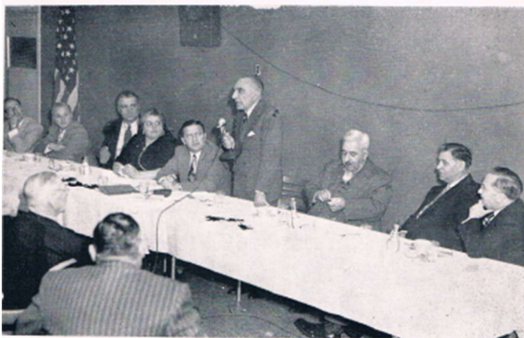
27th ANNUAL COLUMBUS DAY BANQUET, 1950

First Activity to be held in the new hall