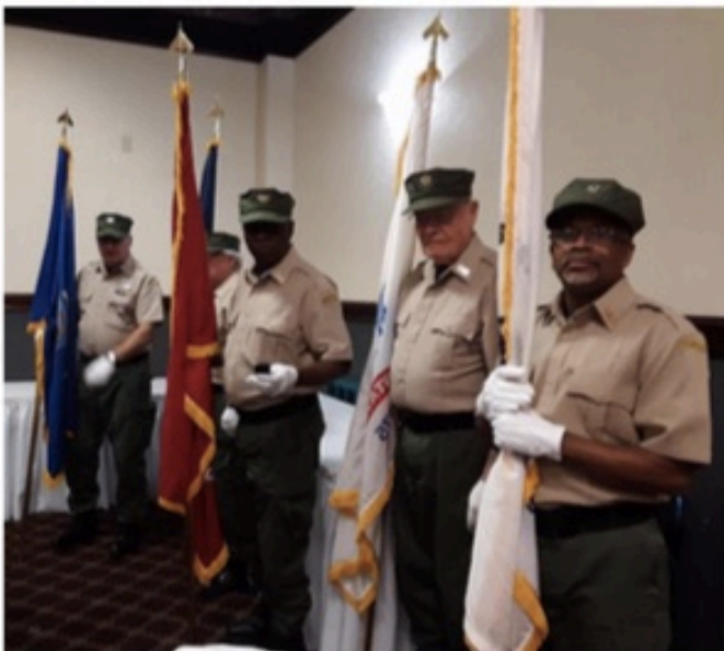
Vietnam Veterans VVA767 prepares to present the colors