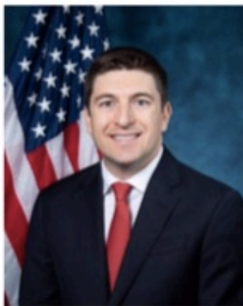
Congressman Bryan Steil