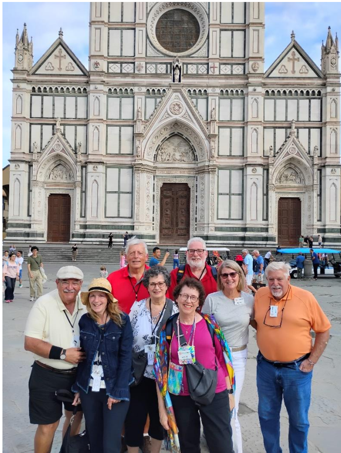
Top Right Photo: Basilica di Santa Croce, located on the Piazza di Santa Croce in Florence. It is the burial place of notable Italians, including Michelangelo, Galileo and Machiavelli.