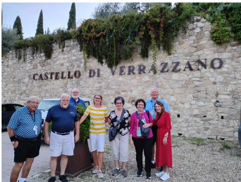
Lower Right Photo: Castello De Verrazzano, a large family owned estate. Many acres of vineyards and olive trees. Tour included their winery and a restaurant where fine food was highlighted by their wines and olive oil.