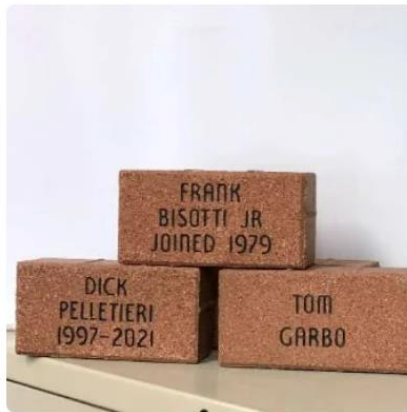
4" x 8" Brick $75.00

Orders taken will be completed and installed as time and conditions permit.