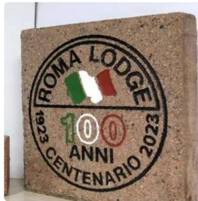
12" x 12" Brick $200.00