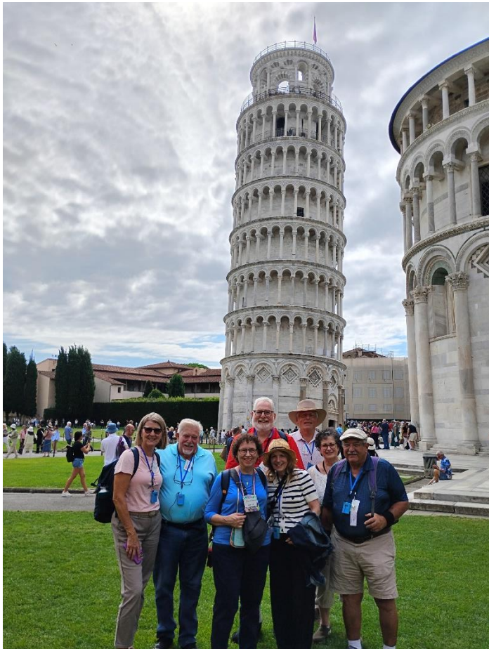
Top Left Photo: Visiting Pisa to confirm the tower is still leaning.