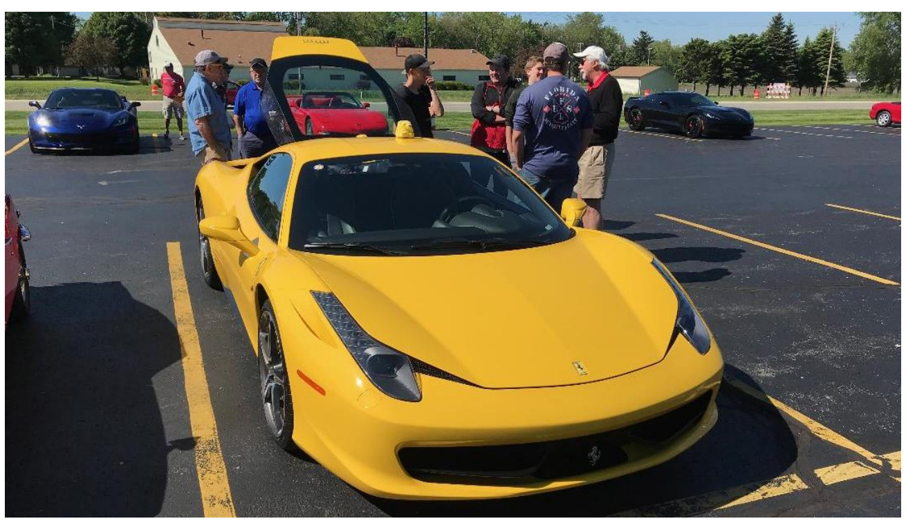
A beautiful 2012 Ferrari cruised in and showed off for us.