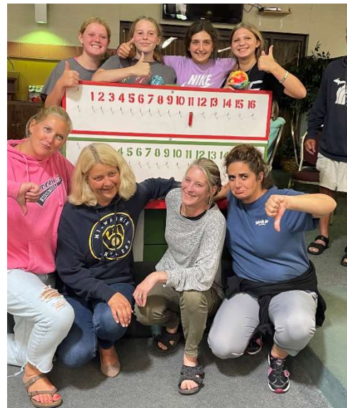
LADIES CHAMPIONS & RUNNERS UP – BELLES OF THE BALL