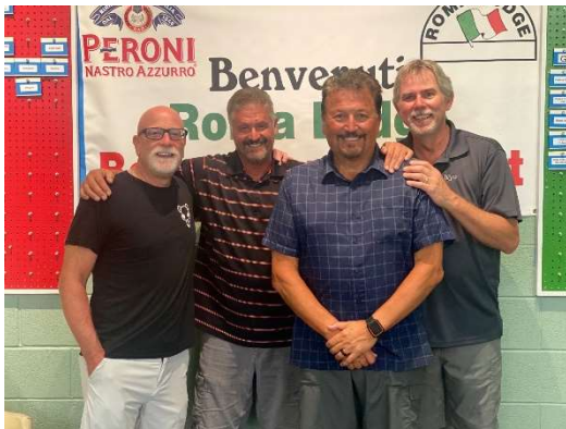
MENS CHAMPIONS - WILD GUYS