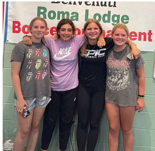
LADIES CHAMPIONS – NEW KIDS ON THE BOCCE