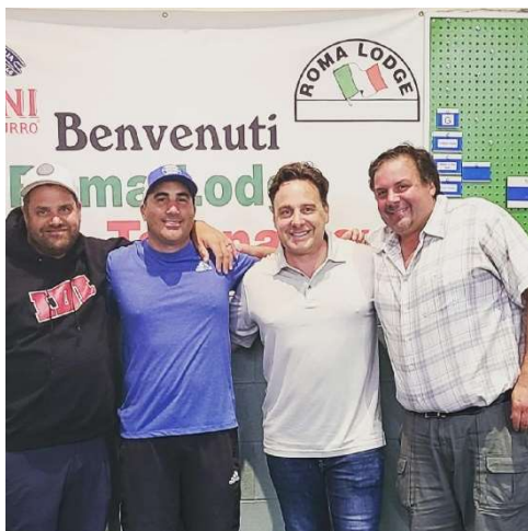
MENS RUNNERS UP – ANY GIVEN SUNDAY